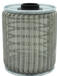
100 Micron Stainless Steel Element