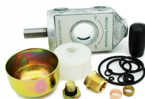
Tankmaster Upgrade Kit