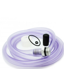
Tankmaster Service Kit