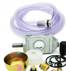
Tankmaster Service & Upgrade Kit