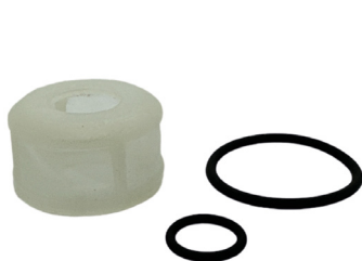
Replacement Filter Kit