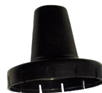
Spare Weatherproof Dust Cap