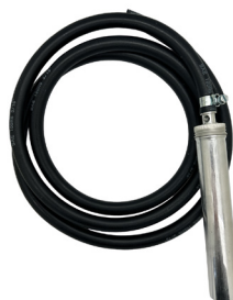
Replacement Float Kit